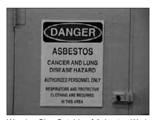
Warning Sign Outside of Asbestos Work Being Conducted in a Boiler Room

An appropriate sign displayed at the entrance and around the perimeter asbestos cleanup work or removal project is shown (right) and represented in the following text.