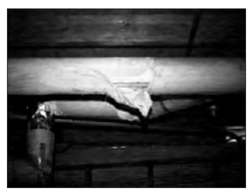
Minor Damage to Pipe Wrap