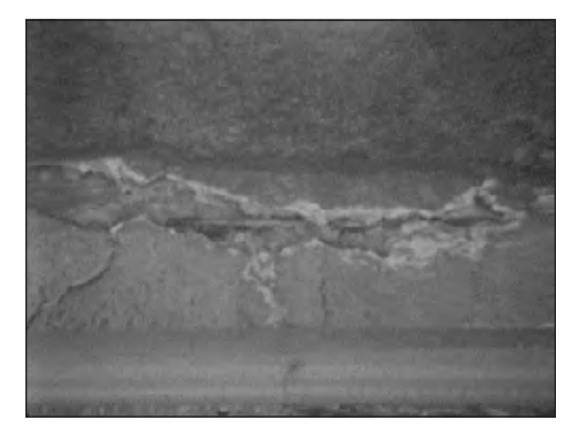
Major Damage to Fire Insulation

These minor incidents of fibre release can be treated with standard wet cleaning or HEPA vacuuming techniques. In such cases, the following procedures must be used by workers properly trained to work with asbestos: